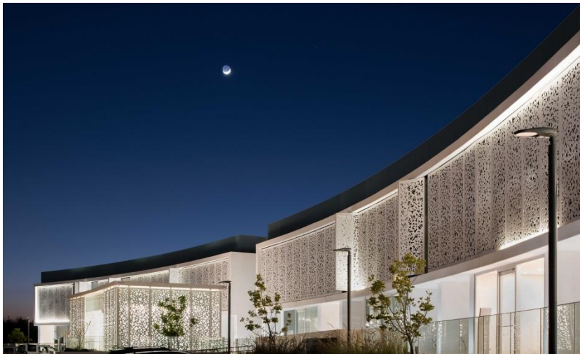
Rama Mendelsohn's philosophy is that the lighting needs to complement the architecture and design of the project.

Rama Mendelsohn: The lighting needs to complement the architecture and design of the project. When approaching each project, I take into careful consideration the overall look and feel and allow the lighting to follow.