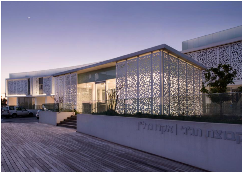
The goal in the Arsuf Promenade project was to achieve a calming effect through the lighting design.