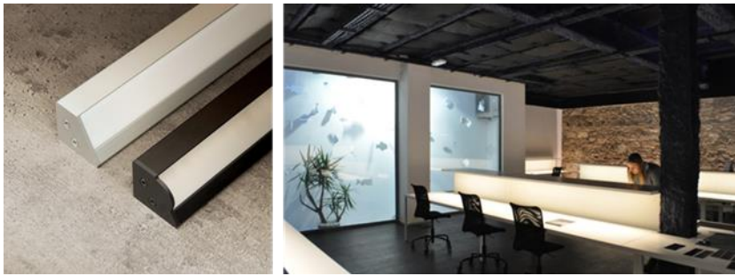
The VESTA is a linear LED luminaire that has been designed for use on cabinets and provides high quality light on work surfaces.

On 3 rd July 2017 in Essen the crowning conclusion of the Red Dot Award: Product Design 2017 takes place. During the award ceremony "Red Dot Gala", the Red Dot winners receive their deserved certificates. For five weeks, the special exhibition "Design on Stage" shows the award-winning products of the year within the world's largest exhibition of contemporary design.